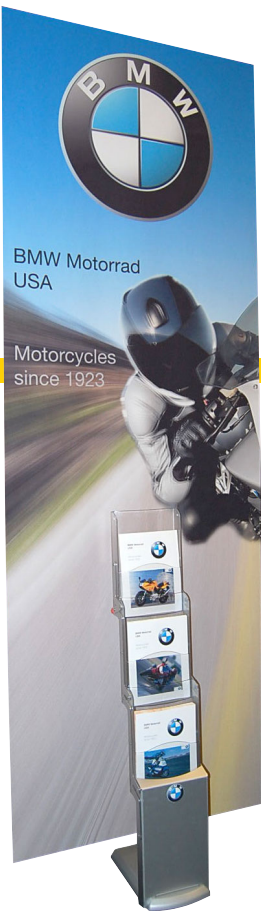
112" high fabric banner