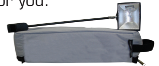
Optional 50w Halogen Spotlight with Bag

The infoPlus combines a high quality literature rack with a graphic for a Super Look! You can make it double-sided and catch your audience coming and going. To customize your display, add your brand image or promotional message on the vertical base. With the combination of a light, literature rack and graphic, the infoPlus is a banner stand that works for you.