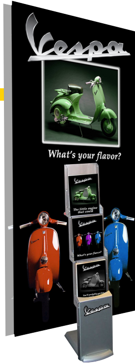
89" high fabric banner, double-sided